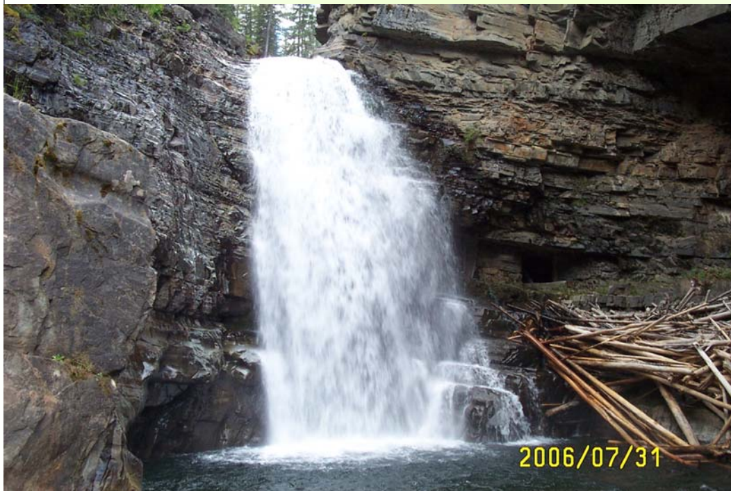
Moyie Falls (T.Wideski)